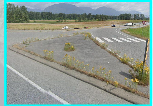
Cyan hatched area depicts TCPr location and escape route. Photo above depicts TCPr location and escape route

Notes: - Plan was prepared in accordance with MoTI TMM 2020. - Client has been notified of the WorkSafeBC OHS Regulations Part 18 amendment & it is their responsibility to ensure site compliance. - Plan must be reviewed if there are any changes to the findings of risk assessment (provided), or after one year. - Implementation of set up to follow the process outlined in the SJP-019 Device Installation Safe Job Procedure. - Advanced Warning Sign distances may be shortened to suit urban block length. - 3.5m lane width to be maintained. - TCP to identify & illustrate escape route once on site. - Should the escape route illustrated become no longer viable, the traffic control onsite to note change in position on FLRA. - After working hours, road configuration to be re-instated. - TCP to assist pedestrians through closure.